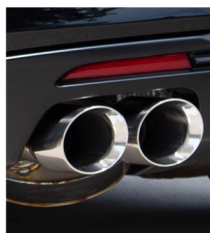
High-polished, dual dual stainless steel exhaust tips.