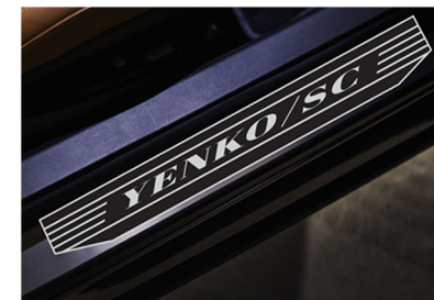
YENKO/SC® doorsill plates.