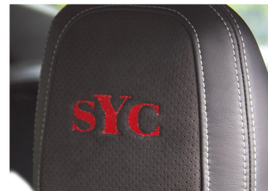
sYc® embroidered front seat headrests.