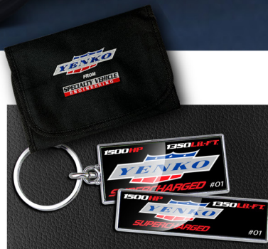
YENKO® Crest key fobs and sequentially numbered power badge (1-50 Stage I & II, 1-100 Stage III) and YENKO® Crest embroidered portfolio.