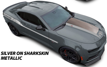
SILVER ON SHARKSKIN METALLIC