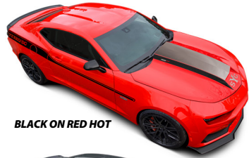
BLACK ON RED HOT

With 11 factory paint color choices, and 9 colors plus optional carbon fiber available for the sYc® side and hood scoop cowl graphics, you can personalize your 2024 YENKO/SC® Camaro so it's really unique and more collectible. Custom graphic colors are also available and the same color can be added to the brake calipers and supercharger (optional). All of our graphics are made from OE-quality, UV resistant vinyl that won't fade, crack, or peel.