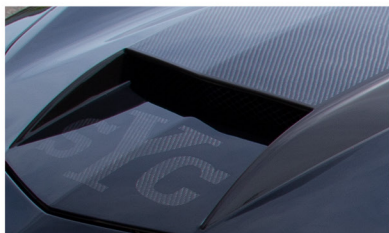
Body color painted carbon fiber hood with exposed carbon fiber scoop.