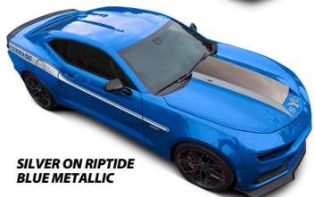
SILVER ON RIPTIDE BLUE METALLIC