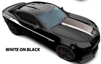
WHITE ON BLACK