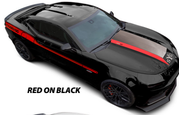
RED ON BLACK