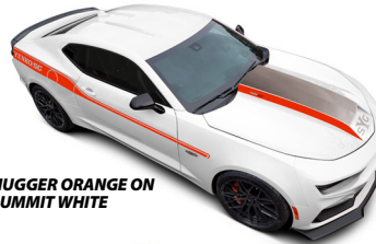
HUGGER ORANGE ON SUMMIT WHITE