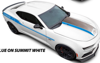
BLUE ON SUMMIT WHITE