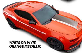
WHITE ON VIVID ORANGE METALLIC