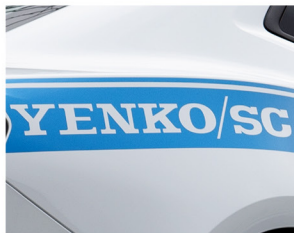
YENKO/SC® body side stripes.