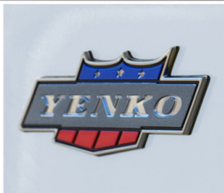
YENKO® Crest badges for front grille, fenders, and rear panel.