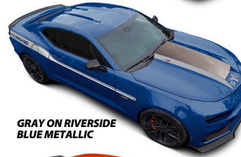
GRAY ON RIVERSIDE BLUE METALLIC