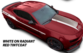
WHITE ON RADIANT RED TINTCOAT