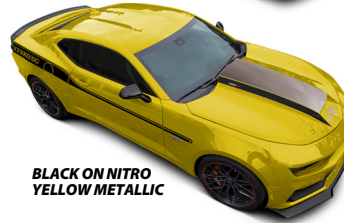
BLACK ON NITRO YELLOW METALLIC