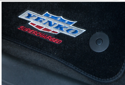
YENKO® Crest Supercharged embroidered premium front floor mats.